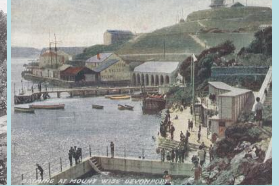
Mount Wise foreshore, with the park and redoubt beyond, c.1905