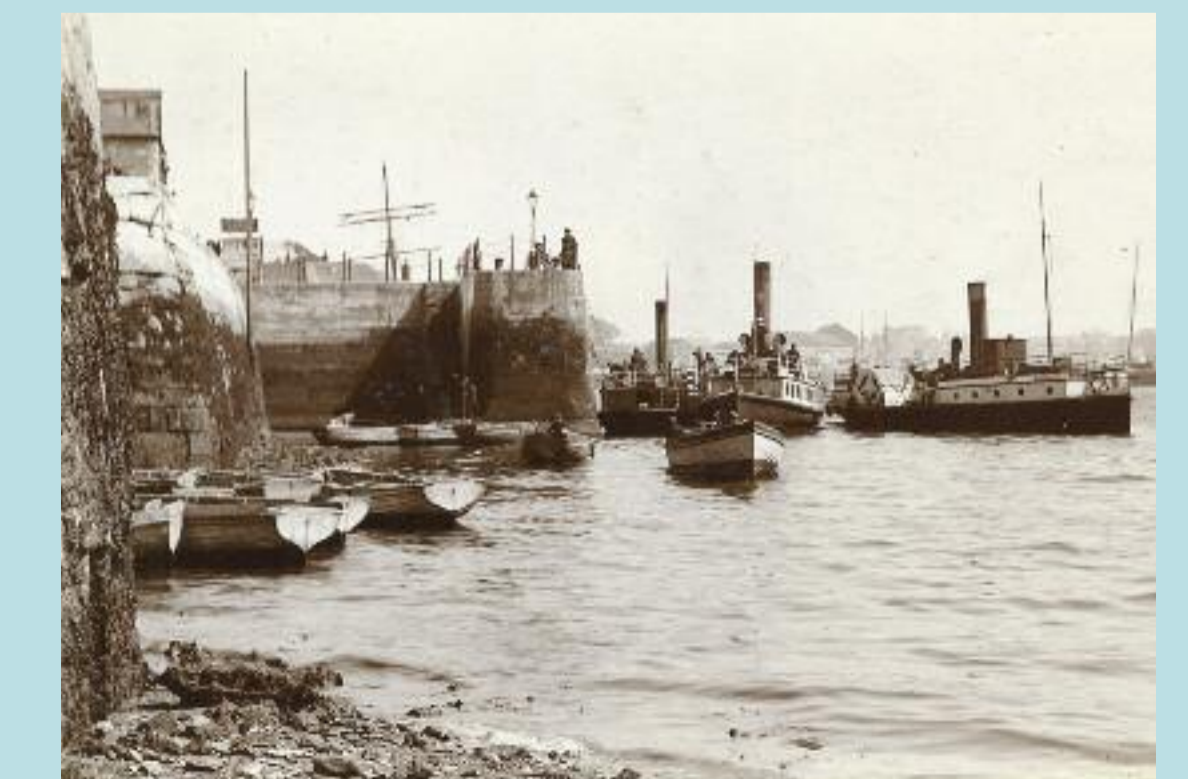
Ferry boats and steamers alongside Mutton Cove pier, c.1900