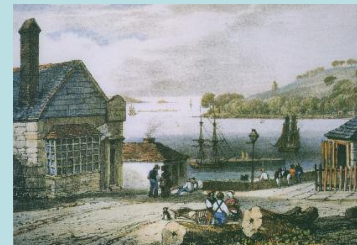
Mutton Cove and view across the Tamar, c.1830

Beyond Mayflower Marina and 'Poor Man's Corner' is a small beach area. By 1825 this was the site of the Royal Clarence Baths. Close by, on the site of Blagdon's Boatyard, were Victoria Cottages. This was where Charles Darwin lodged before embarking on HMS Beagle in 1831. The Dockyard defences and the military have shaped the shoreline landscape, - with a network of Second World War tunnels and a Cold War nuclear bunker cut into the rock and under Mount Wise.